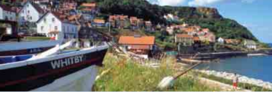
Left: Runswick Bay, North Yorkshire.