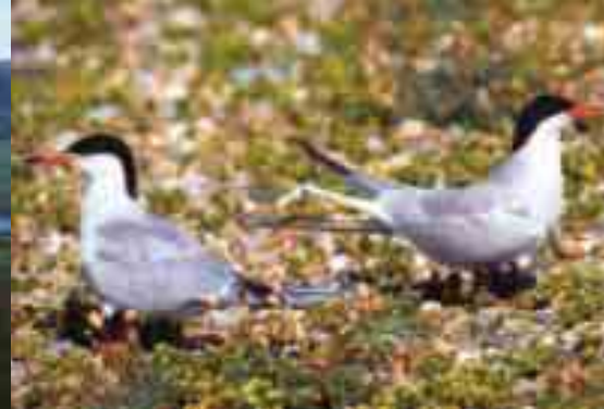
Left: Terns.